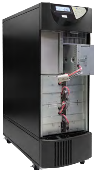
TX90-10K front view (panel removed)